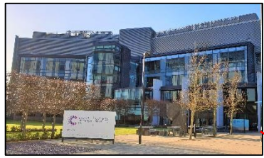
CRUK Cambridge Institute