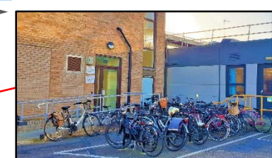
CUTRCTO - Norman Bleehan Offices