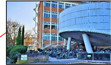
CMDL- Clifford Allbutt Building