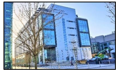
Jeffrey Cheah Biomedical Centre