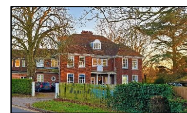
Strangeways Research Laboratory