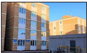
CCTC - Coton House