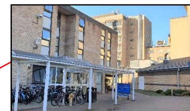
Clinical Oncology - R4