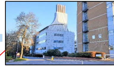
Hutchison/MRC Research Centre