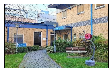
Cambridge Breast Cancer Research Unit