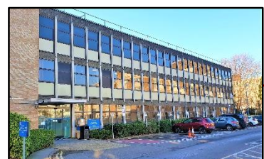
CCTC - S4